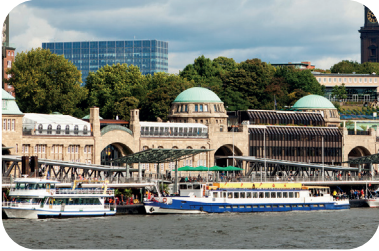
Hamburg boat rides ( staggering vertigo )

You can prove your balance in the beautiful city of Hamburg which offers a range of attractions.