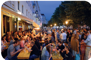
Schanze ( Toxic induced positional vertigo )