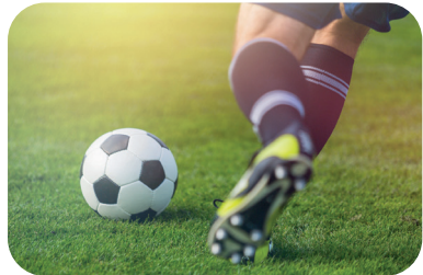
Football clubs HSV and St. Pauli