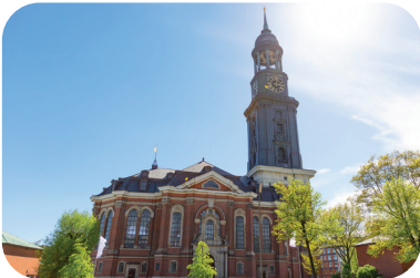
Observation deck at St. Michaelis Church ( phobic vertigo )