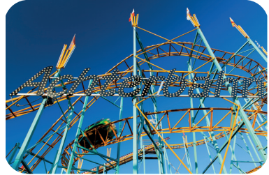
Hamburger Dom ( rotary vertigo/ elevation-induced vertigo )